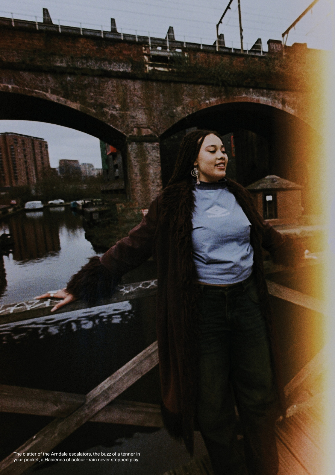
The clatter of the Arndale escalators, the buzz of a tenner in your pocket, a Hacienda of colour - rain never stopped play.